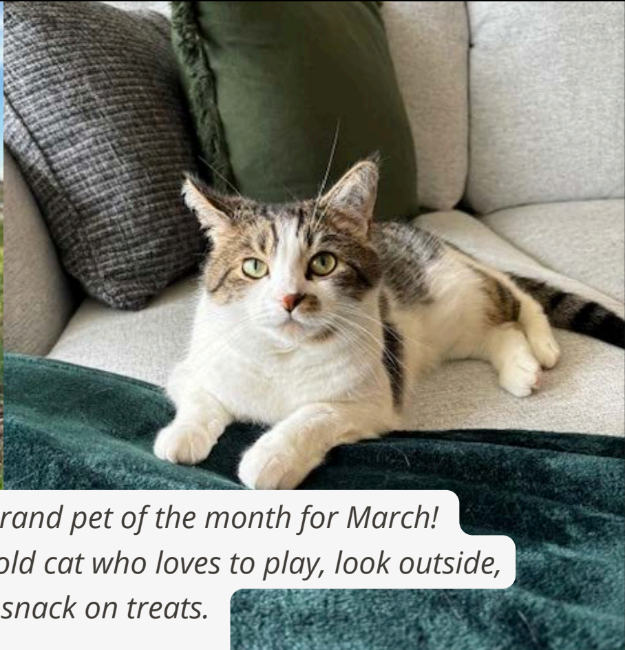
Pippi is the Orange Grand pet of the month for March! Pippi is a very silly 2 year old cat who loves to play, look outside, and snack on treats.